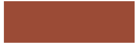
WATERMELON DARK 2 BAGS / 1 YARD