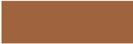
WATERMELON LIGHT 1 BAG / 2 YARDS